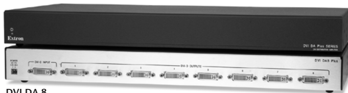
DVI DA 8

The DVI DA Plus Series are DVI distribution amplifiers with four, six, or eight outputs. Each product accepts a single link DVI signal from a source and distributes the signal to multiple attached devices. All DVI DA Plus models feature EDID Minder, and source signal presence indication. They are ideal for use in all applications that require reliable distribution of high resolution DVI digital video signals.