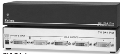
DVI DA 4